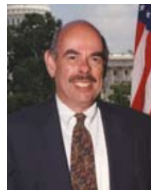
Representative Henry A. Waxman California's 30th Congressional District