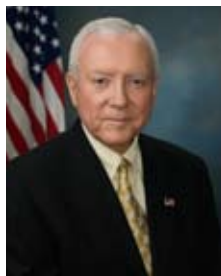
Senator Orrin G. Hatch United State Senator, Utah